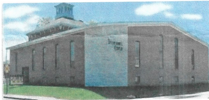
The Deliverance Center 1008 Congress St. Portland, Me.