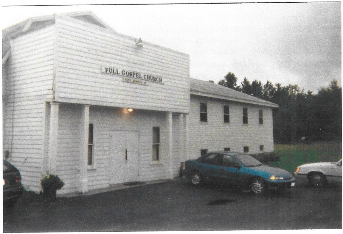
Full Gospel Church